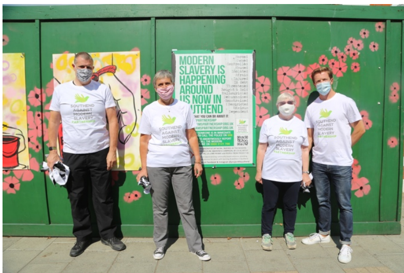
Participants of the SAMS Steering Group promoting the poster awareness campaign

Localised antislavery partnerships are supported and incubated by Together Free while they emerge and develop towards maturity. The Southend Against Modern Slavery (SAMS) Partnership is held within the Together Free Foundation.