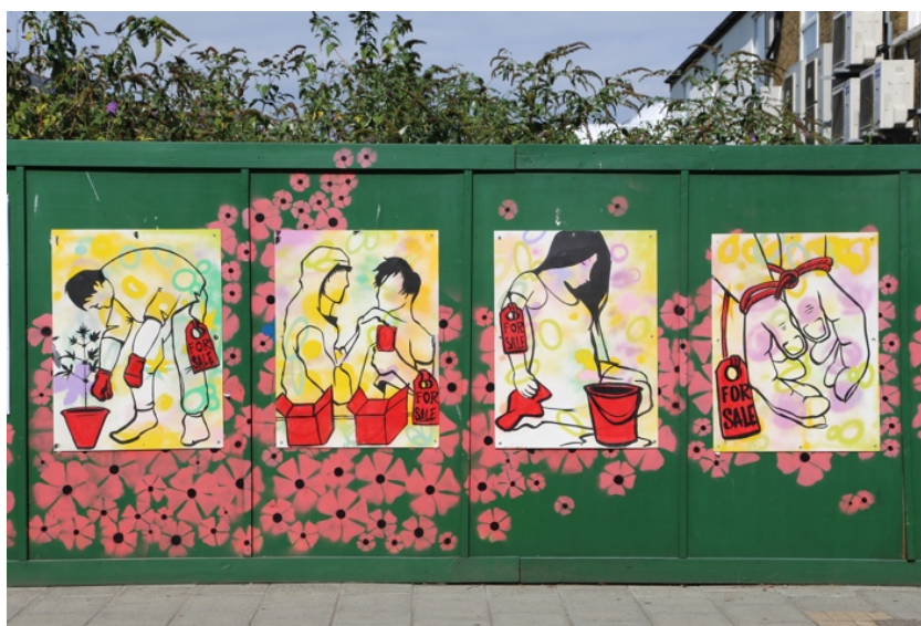
Street Art commissioned by SAMS Partnership

Raising awareness is a key part of stopping MSHT as it develops community resilience among the public, among organisations working with vulnerable people; among at-risk and vulnerable groups and for front-line professionals who work with exploited people.