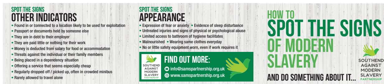
Awareness raising tri-fold card for public distribution by partners